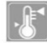
High precision thermostat