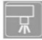
Pressure safety valve