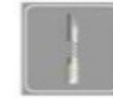
High efficiency inlet pipe