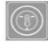
High density insulation